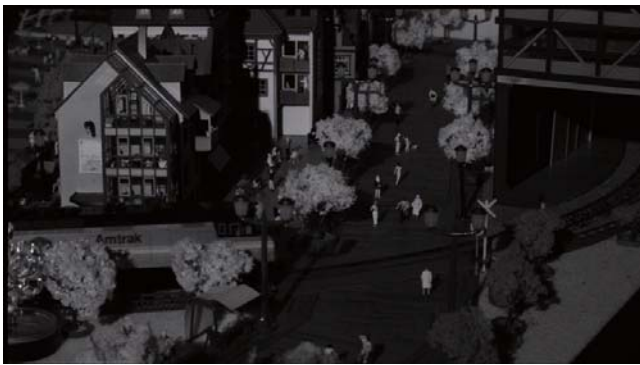
IMX122LQJ (Existing Sony product)