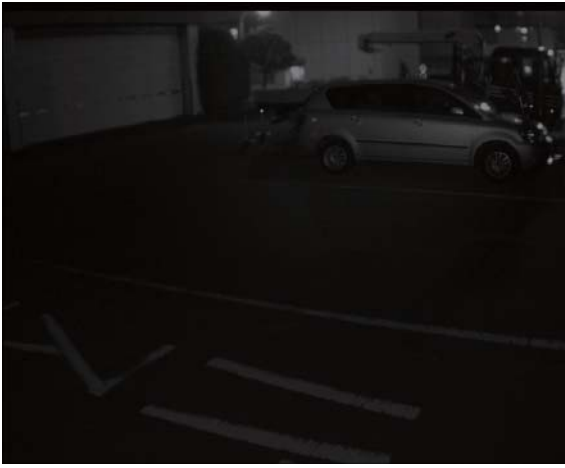
IMX138LQJ (Existing Sony product)