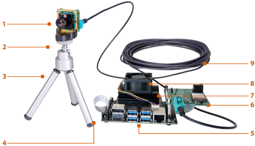
Fig. 2 The Imaging Source Development Kit for NVIDIA Jetson Nano