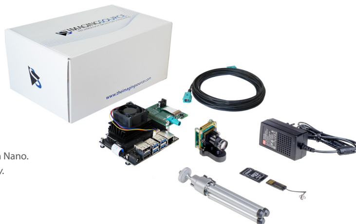
Fig. 1 Scope of delivery* Development Kit for NVIDIA Jetson Nano. *Image for illustration purposes only.