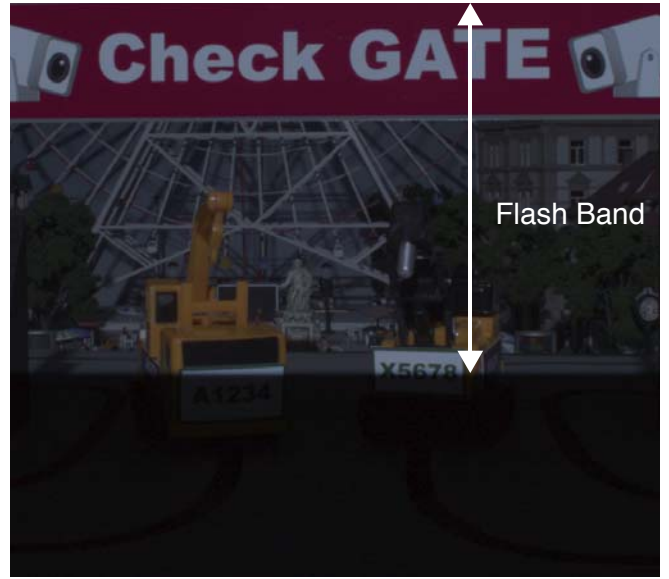
The existing type (Rolling Shutter)