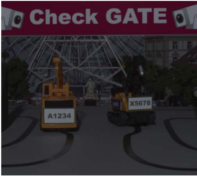
IMX249LQJ (Global Shutter)