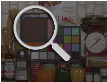
IMX273 (3.75 μm pixels approx. 1.55M effective pixels)

Condition: 20 lx F 4.0 (ADC 10-bit mode, 30 frame/s, internal gain 18 dB)