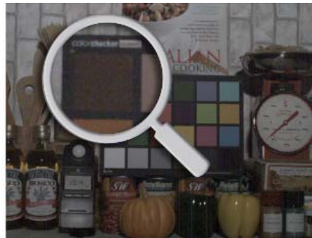
Competing product A (4.8 μm pixels approx. 1.31M effective pixels)