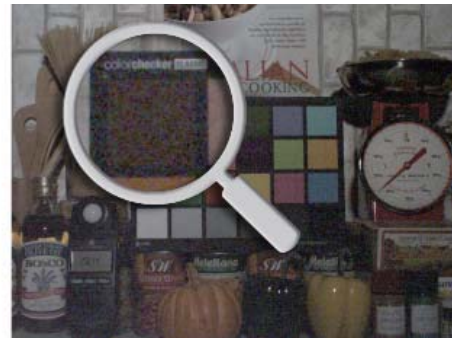
Competing product B (4.5 μm pixels approx. 1.92M effective pixels)