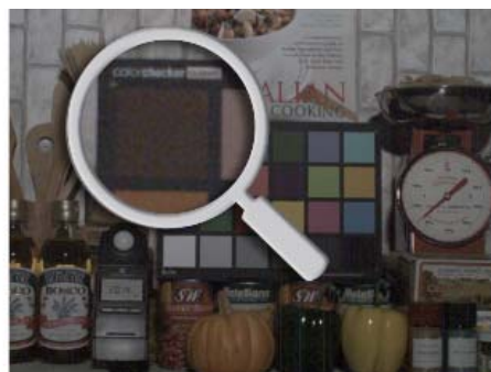
Competing product A (4.8 μm pixels approx. 1.31M effective pixels)