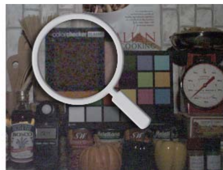
Competing product B (4.5 μm pixels approx. 1.92M effective pixels)