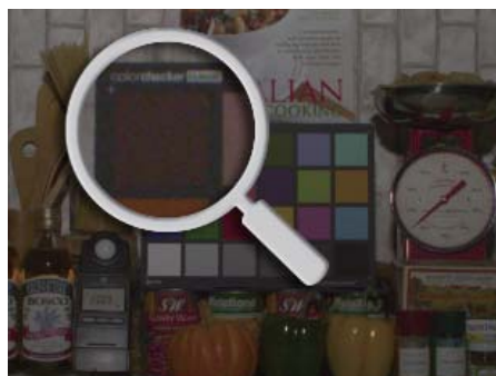
IMX273 (3.75 μm pixels approx. 1.55M effective pixels)

Condition: 20 lx F 4.0 (ADC 10-bit mode, 30 frame/s, internal gain 18 dB)